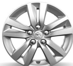
16" 'Quartz' Alloy