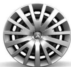
15" 'Ambre' Trim

1. Allure 1.6 BlueHDI 120 manual is fitted with 16" 'Diamond' alloy wheel