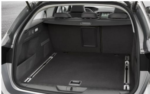
Rear seats in place with boot cover retracted, up to 810 litres of space (loaded to roof).

Aluminium Boot Rails: For additional security on the move, boot rails, complete with adjustable tethering hooks can be used to prevent items moving. (Optional on Allure models, standard on GT Line & GT models)