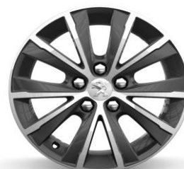
16" 'Diamond' Alloy