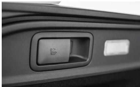
"Magic Flat" rear seats boot release switch.