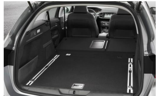
"Magic Flat" rear seats folded, up to 1775 litres of space (loaded to roof).