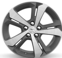
17" 'Rubis' Alloy