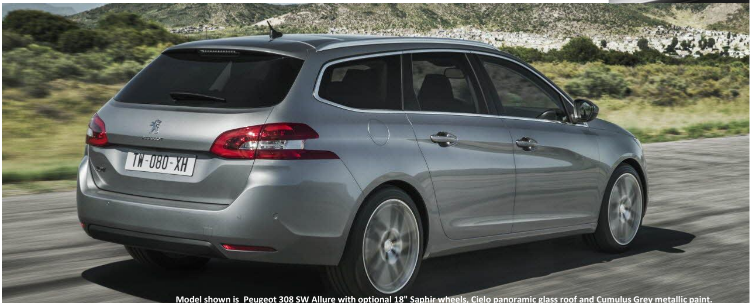
Model shown is Peugeot 308 SW Allure with optional 18" Saphir wheels, Cielo panoramic glass roof and Cumulus Grey metallic paint.