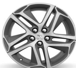
18" 'Saphir' Alloy