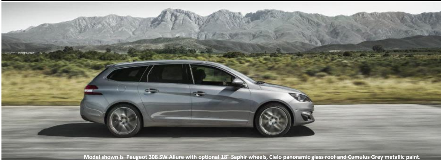
Model shown is Peugeot 308 SW Allure with optional 18" Saphir wheels, Cielo panoramic glass roof and Cumulus Grey metallic paint.