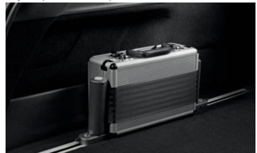
Aluminium Boot Rails with accessory boot retainer (available at extra cost).

Model shown is Peugeot 308 SW GT with optional Magnetic Blue metallic paint.