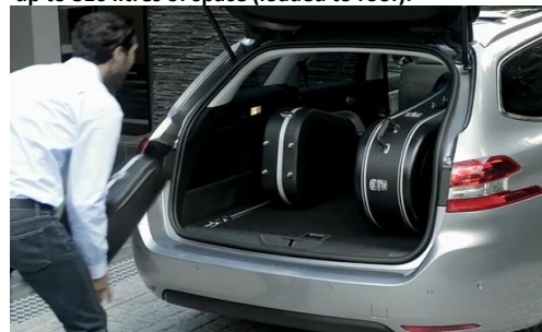
Low Boot Sill for easier loading.