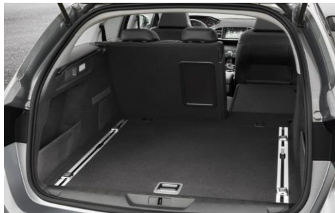
"Magic Flat" rear seats 2/3 1/3.