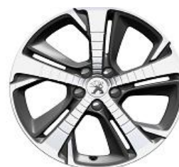
18" 'Diamant' Alloy